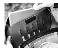
Opening lid compartment: 20,5cm / 8.1in.

Handlebar mounting-set (sold separately):