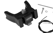
E226 Handlebar Mounting-Set E-Bike