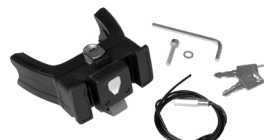
E207 Handlebar Mounting-Set E-Bike with Lock