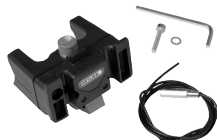
E225 Handlebar Mounting-Set