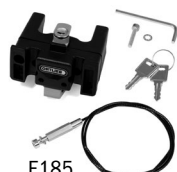
E185 Handlebar Mounting-Set with Lock